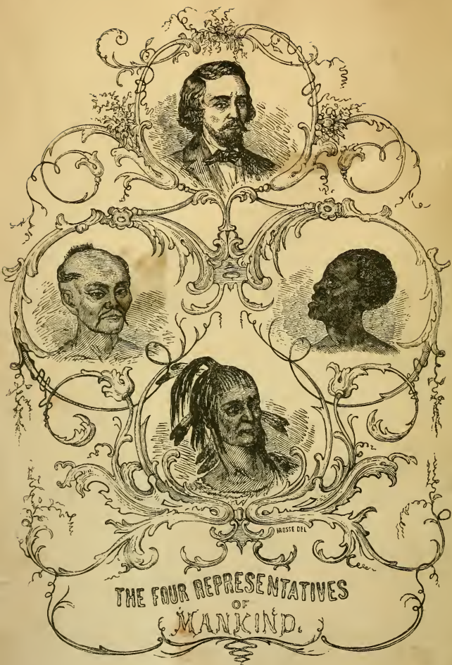
THE FOUR REPRESENTATIVES OF MANKIND.