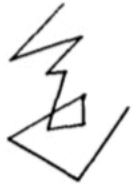
97.- Paschy 13° II