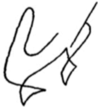
111.-Mafalach 27° II