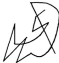
102.- Amagestol 18° II