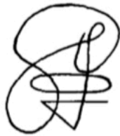
99.- Pigios 15° II