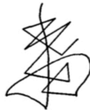
108.- Ygarimi 24° II