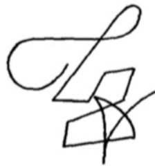
112.-Kaflesi 28° II