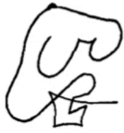
103.- Debam 19° II