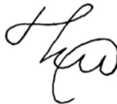
114.-Seneol 30° II