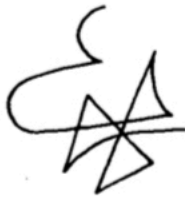
93.-Timiran 9° II