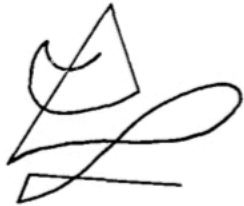
105.- Mimosah 21° II