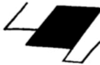
96.-Bagoloni 12° II