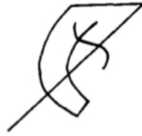
86.- Yparcha 2° II