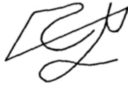
110.-Bilifo 26° II