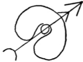
104.- Kolani 20° II