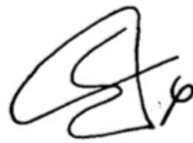
94.-Golemi 10° II