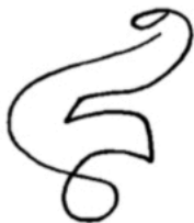
95.-Darachin 11° II