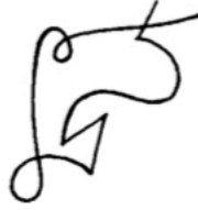
92.-Golema 8° II