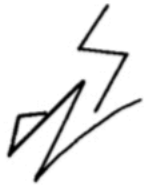
87.- Obedomah 3° II