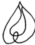
88.- Padidi 4° II