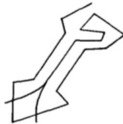
100.- Cepacha 16° II