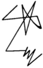
91.-Morilon 7° II