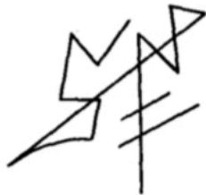
113.-Sibolas 29° II