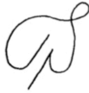
98.- Amami 14° II