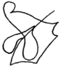
109.-Jamaih 25° II