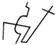
89.- Peralit 5° II