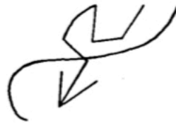
106.- Eneki 22° II