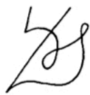
271.-Asoreg 7° ✂