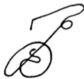
272.-Ramage 8° ✂