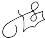
274.-Dimurga 10° ✂