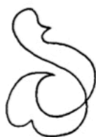
273.-Namalon 9° ✂