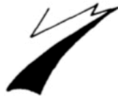
66.-Galago 12° 8