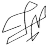
83.-Calamos 29° Ի