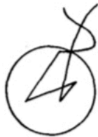
59.-Nasi 5° Ի