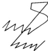
84.-Sapasani 30° Ի