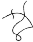
56.-Molabeda 2° Ի