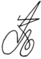
73.-Chadail 19° ʘ