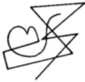
75.-Hagos 21° ʘ