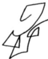
72.-Magelucha 18° 8