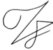
80.-Amalomi 26° Ի