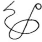
62.-Jajaregi 8° 8