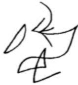
81.-Gagison 27° Ի