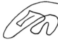
78.-Baalto 25° ʘ