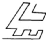
68.-Pafessa 14° 8