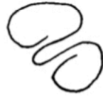
74.-Charagi 20° ʘ