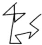
67.-Paguldez 13° 8