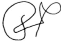
65.-Dosom 11° 8