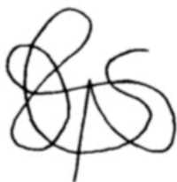
69.-Jromoni 15° 8