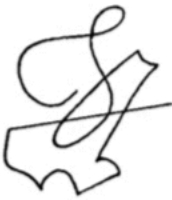
77.-Camalo 24° ʘ