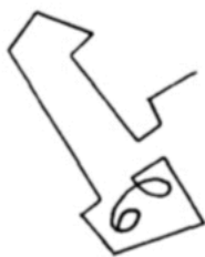
70.-Tardoe 16° 8