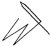
55.-Serap 1° Ի