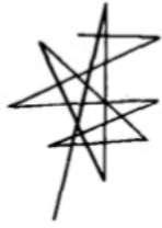
61.-Carubot 7° 8