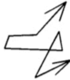
76.-Hyla 22° ʘ