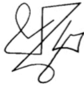
82.-Carahami 28° Ի