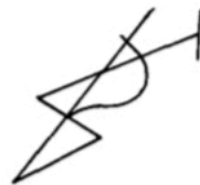
60.-Conioli 6° Ի